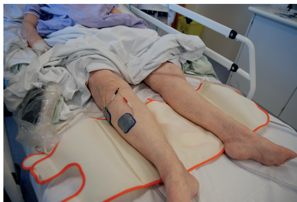
Fig. 2. Electrode position for electrical stimulation of the peroneal nerve for increased blood flow to the lower limb (posed with a mannequin).

NMES has been approved by NICE as an alternative prophylaxis when other mechanical and pharmacological methods of prophylaxis are impractical or contraindicated (47, 48). The transcutaneous application of electrical impulses stimulates the common peroneal nerve to generate dorsiflexion in the lower limb, which, in turn, activates the calf muscle pump, emulating the normal physiological response achieved by walking, without the patient having to mobilize. Electrode positioning is demonstrated in Fig. 2. NMES has been shown to