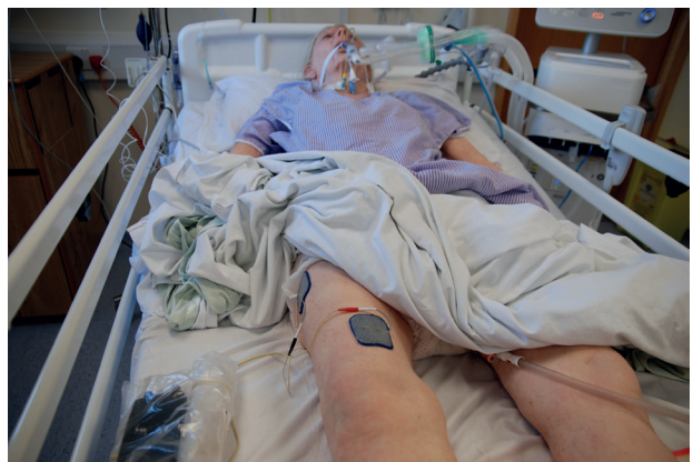
Fig. 1. Electrode positioning for electrical stimulation of the quadriceps (posed with a mannequin).

The application of NMES to treat ICUAW is well documented within the evidence-base (15–18). The primary objective of interventions has been to induce intermittent muscle contractions with electrical stimulation to minimize the loss of muscle mass and excitability, to strengthen these muscles and to enhance the recovery of mobility during and after discharge from the ICU (19). The findings from pre-clinical work on underlying electrophysiological mechanisms from healthy participants and data from critical care patients suggest that, to prevent ICUAW, an NMES programme should begin in the ICU as soon as medically feasible. This is particularly relevant to people with COVID-19, as early intervention is advised due to the often-prolonged